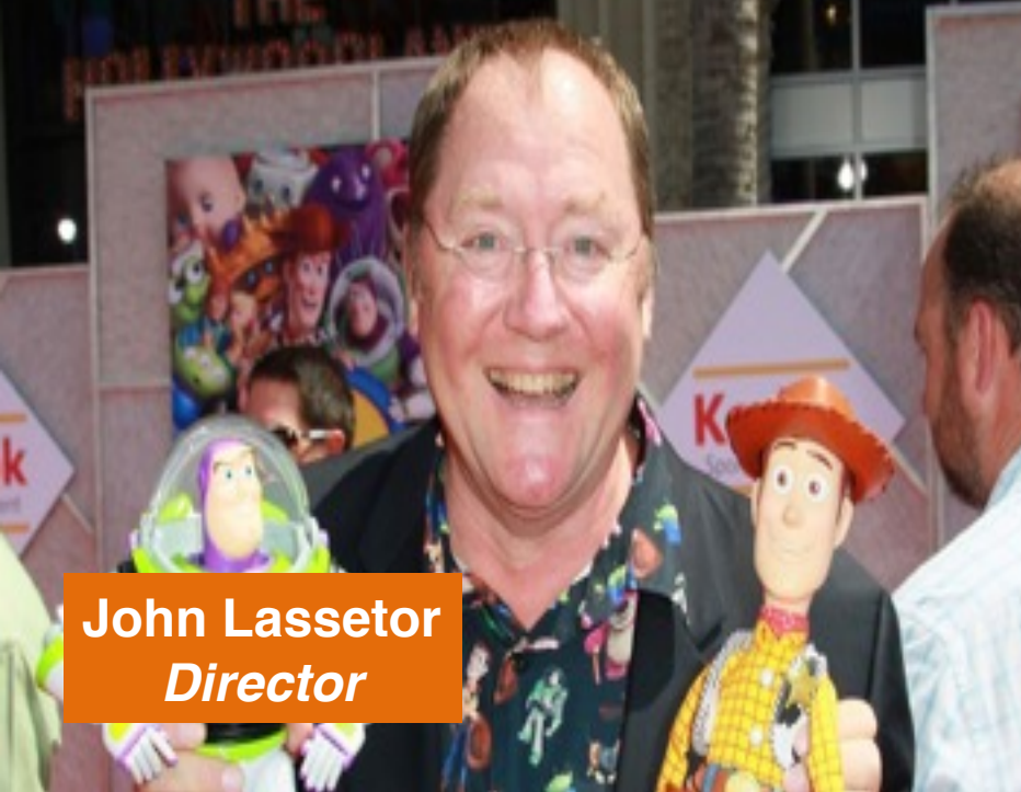
John Lasseter Director